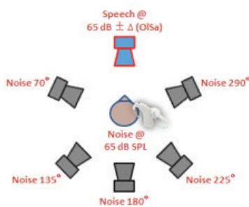
Figure 2. Test setup for Naída CI UltraZoom study. Speech was presented at the front while noise was presented from five loudspeakers located around the test subject (Adapted from Buechner et al, poster presented at ESPCI 2013)

Oldenburg sentences were presented from one speaker in front of the subject. Stationary speech-shaped noise, created from the sentence material, was presented simultaneously from five speakers placed around the subject in a moderately reverberant room. An adaptive procedure was used to estimate the speech reception threshold (SRT) (Kollmeier and Wesselkamp 1997). Figure 2 shows the relative position and angle of the noise sources with respect to the speech source and the subject.