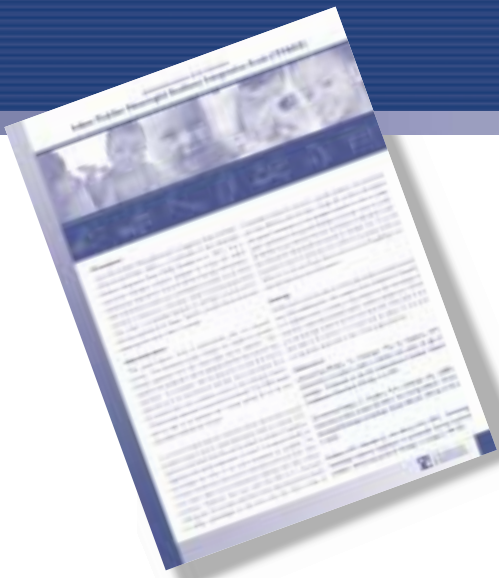
Infant-Toddler Meaningful Auditory Integration Scale (IT-MAIS)

Interestingly, another parent report scale, the Infant-Toddler Meaningful Auditory Integration Scale (IT-MAIS, Zimmerman-Phillips, Osberger, Robbins, 1997) was used to collect parent data from young CLARION implant users at 3- and 6-month post-implant intervals. Zimmerman-Phillips et al (2001) found that for children implanted between 24 and 36 months, OC children showed faster progress on the scale than did TC children. However, for children implanted