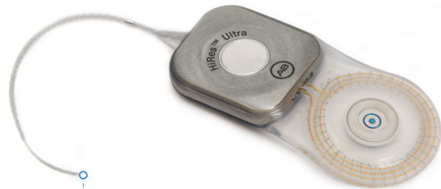
HiRes™ Ultra Cochlear Implant