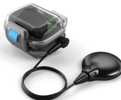
M Waterproof Battery

For unique environments such as the swimming pool, noisy restaurants, or meetings, there are a variety of accessories designed to help you hear your best and be at the centre of the conversation.