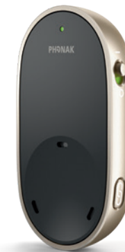
PHONAK PARTNERMIC™ MICROPHONE